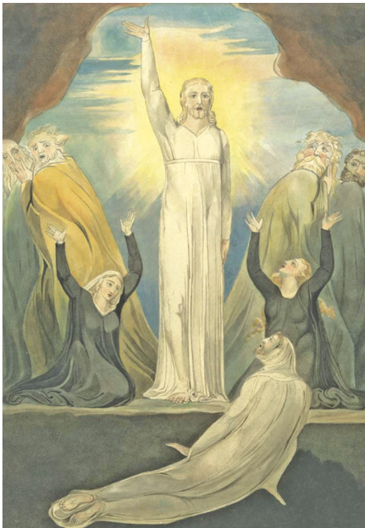
The Raising of Lazarus by William Blake (1800)

Make no mistake: maintaining anger and grudges takes energy. They suck the joy from our lives and, most importantly, they separate us from the forgiving love of God. How