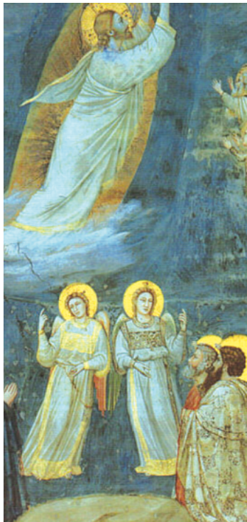
Detail from The Ascension by Gotti

The Ascension allows us to stand there for a moment to acknowledge the loss. Yet it also gently turns us toward what is hidden within it. For what appears to be absence is not the end of Christ's presence, but its transformation. The risen Lord is not leaving us behind. He is drawing us into a deeper way of being with him. He is present in all places. No longer seen with the eyes alone, he is known in word and sacrament,