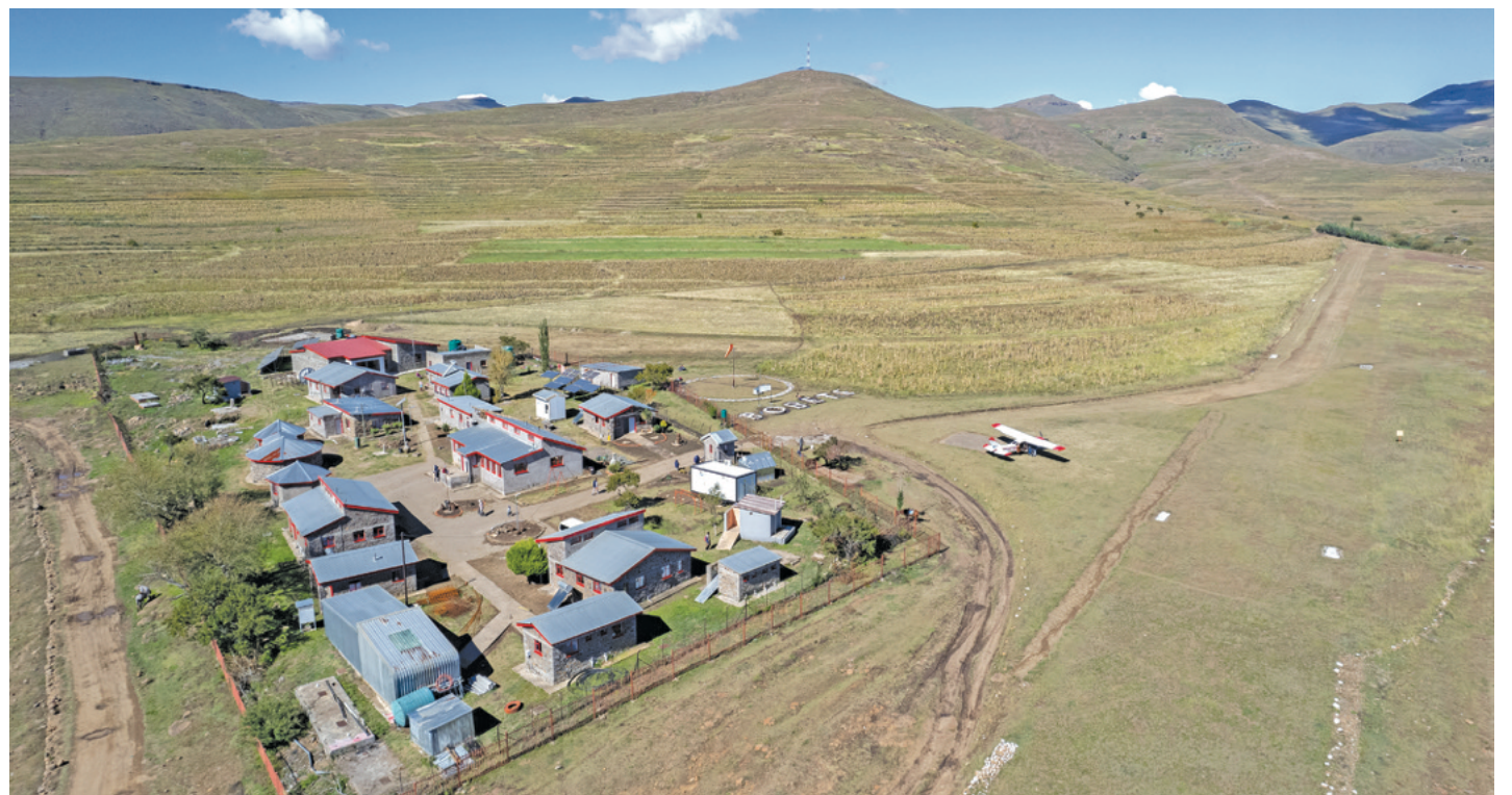
An aerial view of the clinic in Bobete in which you can clearly see the geography and remoteness of this location

Alongside Hope's World of Gifts has featured the new baby starter packs for the last three years and they are a favourite gift for donors and churches. During Advent in 2022, St. Andrew's in Cole Harbour, N.S. raised money to buy new baby kits for the Bobete Clinic. For every $25 that was donated, a diaper was added to a display in the Narthex to encourage donations. At the end of the campaign, the diapers were donated to a local women's shelter and $2,000 was forwarded to Alongside Hope. You can still support the program at