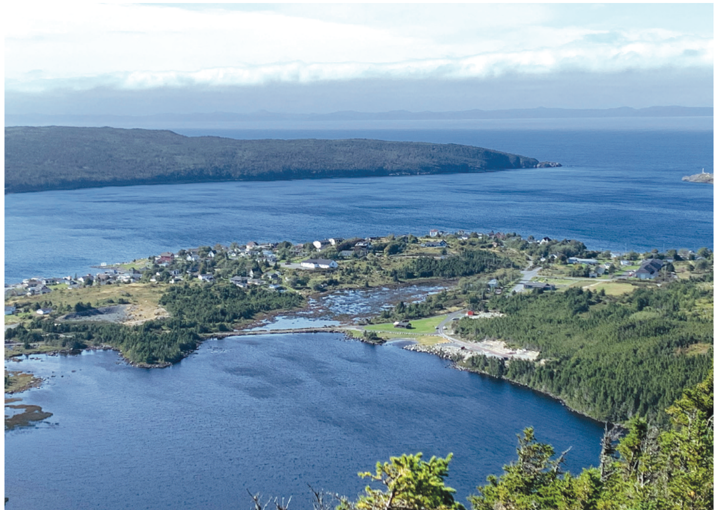
Heart's Content Newfoundland, as seen from the top of the Mizen

But nobody is perfect. We sometimes allow ourselves to get separated from Creation and the Creator, failing to live in harmony with Creation as stewards. We treat Creation as if it is ours, exploiting it. Bulldozing forests, flooding river valleys, polluting skies, and filling oceans with garbage—usually unjustly, at the expense of "others" who are