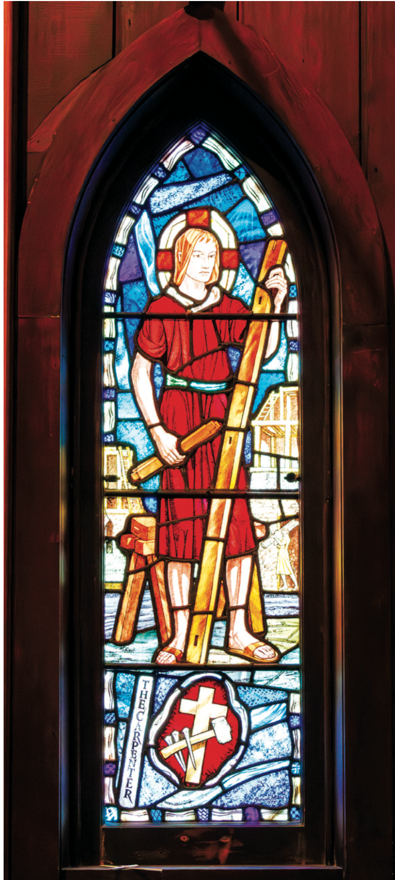
Jesus the Carpenter window, St Mark's Church, Remuera

The Church (note the capital "C") can often times seem like a house that is slowly (or swiftly) falling apart. Sometimes it seems like the roof is leaking, the walls have started to sag; maybe the wiring isn't what it could be, and there's a draft coming from somewhere bringing an odd smell. We get worried about the state of the liturgical framework, fearful that a wall of doctrine that we particularly liked may fall, or that