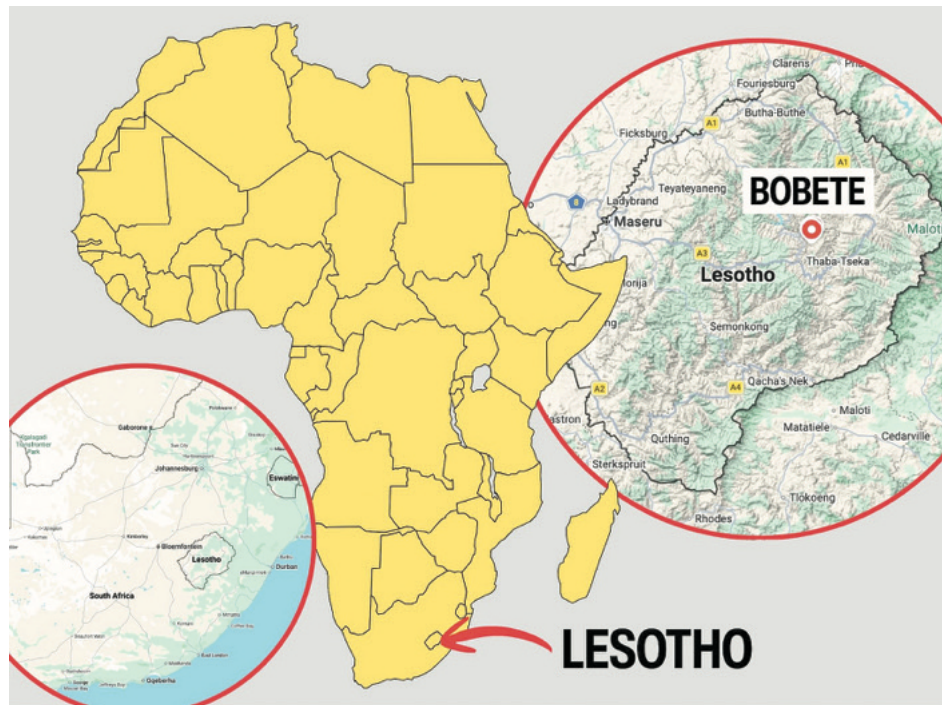
A map of Africa, showing the location of Lesotho